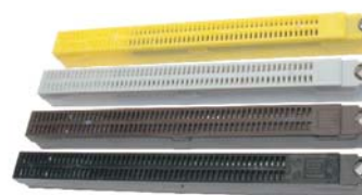
Available in stainless steel