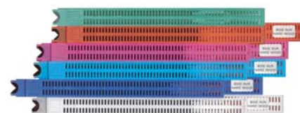
Colour Coded cartridges

Antoine Cassese invented the first wedge in 1976. From the very beginning these wedges were not glue coated, in order to avoid jamming and technical problems, in the underpinned, caused by glue accumulating in the firing mechanism. In addition, this makes it possible 1) to lubricate the wedges so as to protect them against rust, 2) allow a better penetration into the wood and 3) lubricate the internal firing mechanism of the underpinned. Indeed, each time you shoot a wedge you lubricate your machine, i.e. the more you work, the more you maintain your machine. That's the secret of Cassese underpinned longevity.